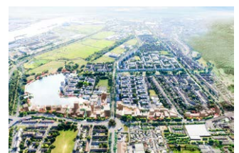
Thamesmead, London, UK Size: 9.86 ha Year: 2015 - 2022