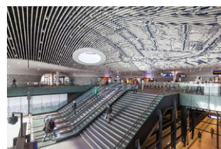
Municipal Offices and Train Station, Delft, NL Size: 28,320 m 2 Year: 2006 - 2017