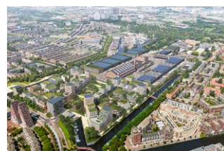
Masterplan Marktkwartier, Amsterdam, NL Size: 200,000 m 2 Year: 2012 - 2023