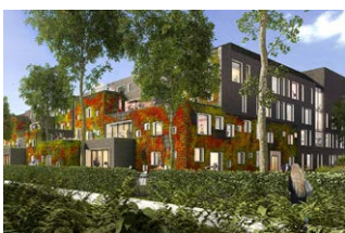
Amsterdam International Community School, NL Size: 16,700 m 2 Year: 2017 - 2021