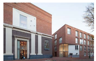
Langebrug Student Housing, Leiden, NL Size: 9,345 m 2 Year: 2010 - 2016