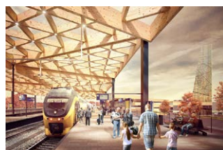
Ede Wageningen Train Station, Ede, NL Size: 15,000 m 2 Year: 2014 - 2025